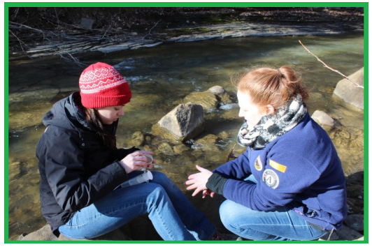
OSMRE/AmeriCorps Members taking water quality samples outside Knoxville, TN

AmeriCorps programs do more than move communities forward; they serve their members by creating jobs and providing pathways to opportunity for young people entering the workforce. AmeriCorps places young adults into intensive service positions where they learn valuable work skills, earn money for education, and develop an appreciation for citizenship. These positions last for one year.